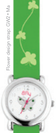
Flower design strap: GW2 • Ma