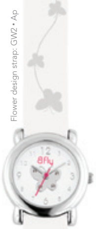
Flower design strap: GW2 • Ap