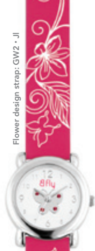
Flower design strap: GW2 • Jl