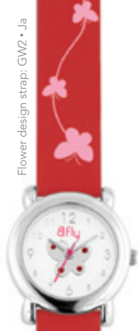
Flower design strap: GW2 • Ja