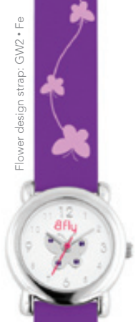
Flower design strap: GW2 • Fe