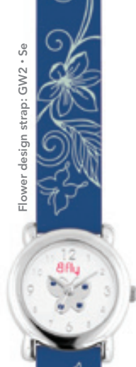
Flower design strap: GW2 • Se