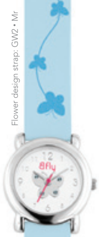
Flower design strap: GW2 • Mr