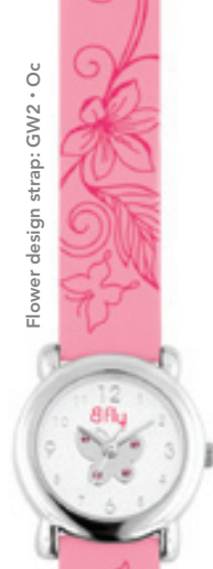
Flower design strap: GW2 • Oc