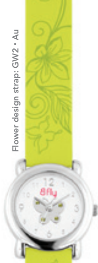
Flower design strap: GW2 • Au